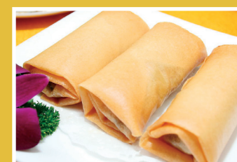
Crispy Shrimp Rolls