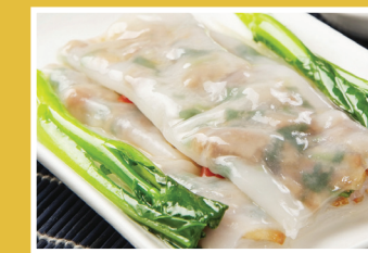
BBQ Pork Rice Rolls