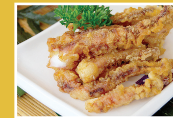
Five Spice Squid Tentacles