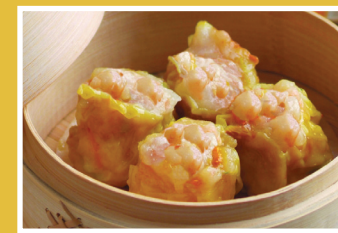
Pork Dumpling with Caviar "Siu Mai"