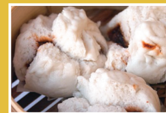
BBQ Pork Buns