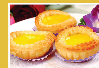
Baked Flaky Egg Tarts