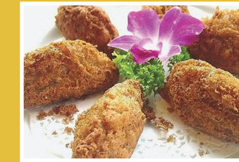
Deep Fried Taro Dumpling stuffed with Meat