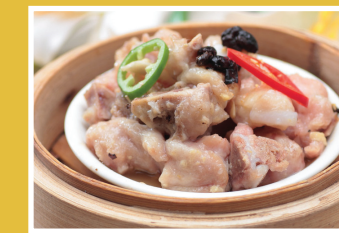
Black Bean Spare Ribs