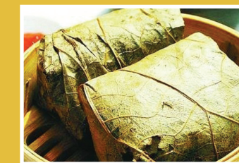
Steamed Sticky Rice with Meat in Lotus Leaf