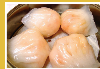
Shrimp Dumpling "Har Gow"