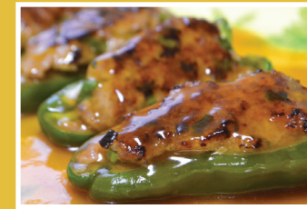
Pan Fried Stuffed Green Pepper