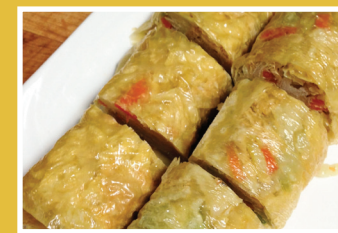
Steamed Vegetarian Beancurd